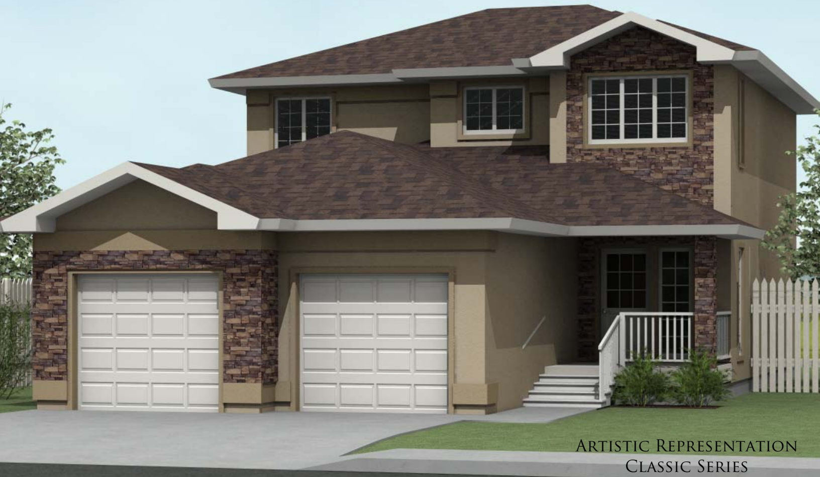
ARTISTIC REPRESENTATION CLASSIC SERIES